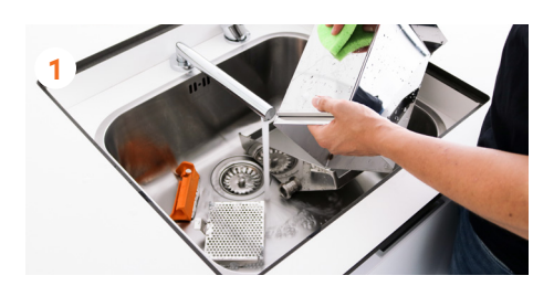
Follow the cleaning process indicated, for all the parts: blade, sub-filter, tank, peel chutes. etc.