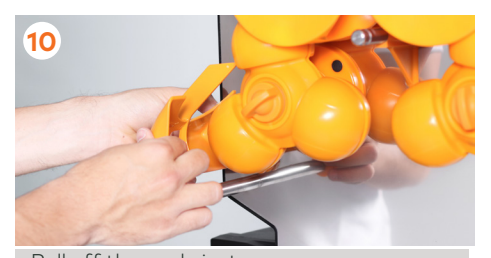
Pull off the peel ejectors.