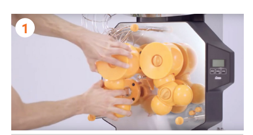
Remove the pressing units.