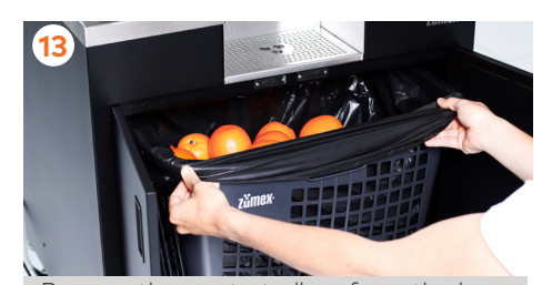
Remove the waste trolleys from the base to empty them.