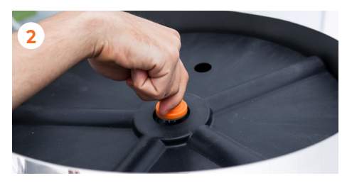
Take off the feeder plate by unscrewing the central knob.