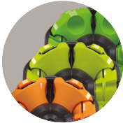
3 Juicing Kits